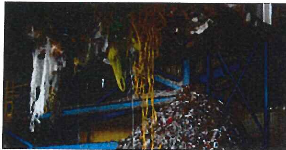
Plastic bags and film hang from a conveyor

The safety of our employees is our utmost concern. Our employees sort recyclables by hand and are in direct contact with every piece of material that is delivered to our Recovery Facilities. When plastic bags are improperly mixed in with acceptable recyclable materials, the bags entwine in the equipment. This causes unsafe conditions and downtime to clear the equipment so it works properly.